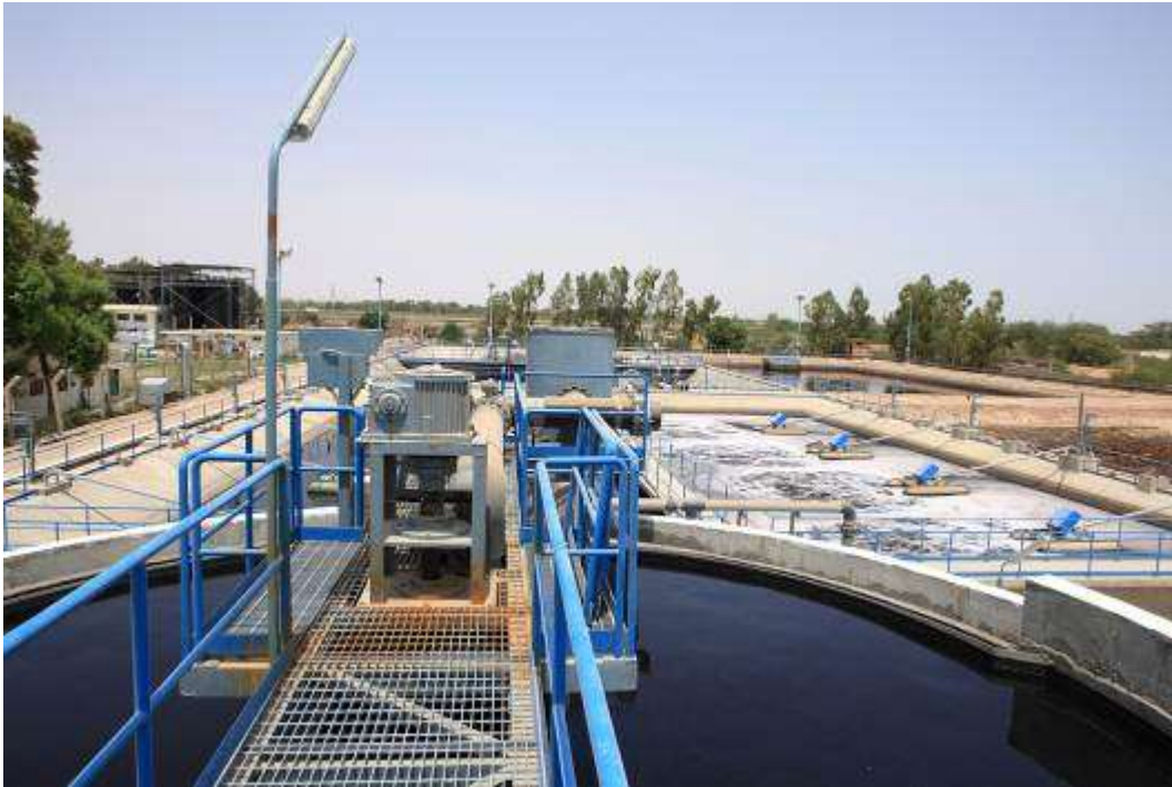
The sustainable effluent treatment (SET) facility of Archroma in Jamshoro, Pakistan.