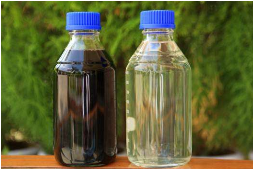
Before and after - The sustainable effluent treatment (SET) facility of Archroma in Jamshoro, Pakistan.