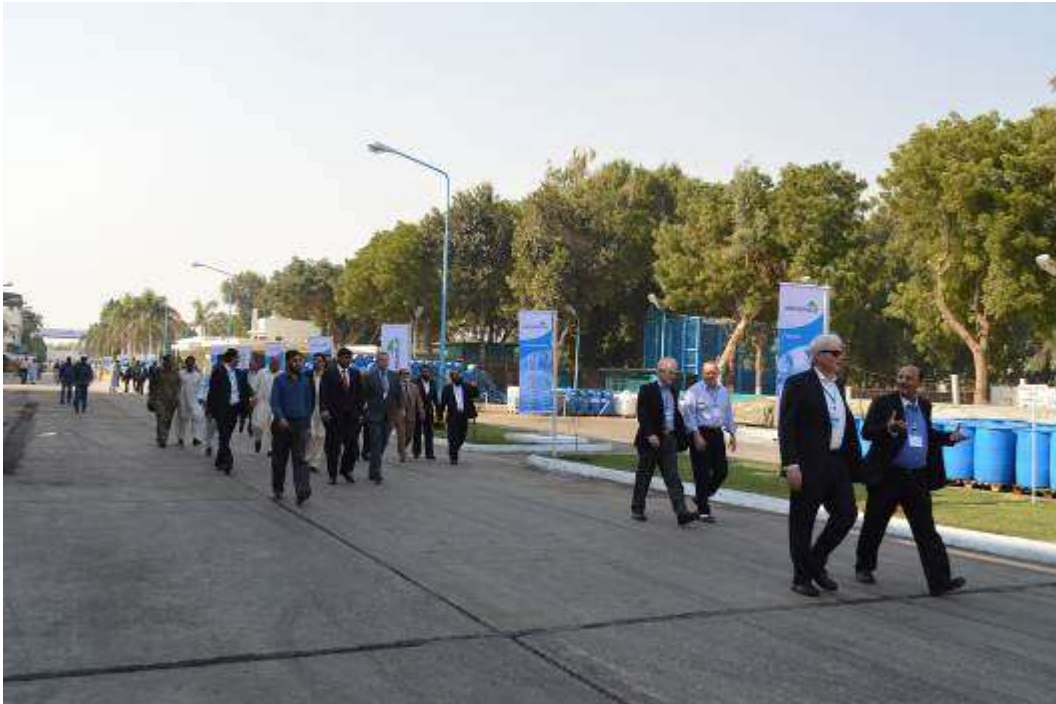
Archroma to open forerunningwater treatment facility in Jamshoro, Pakistan.