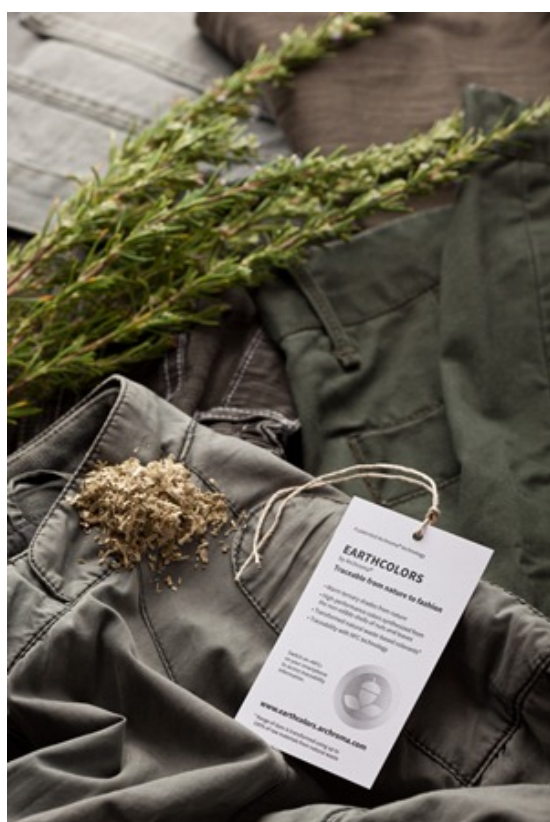
EarthColors by Archroma.